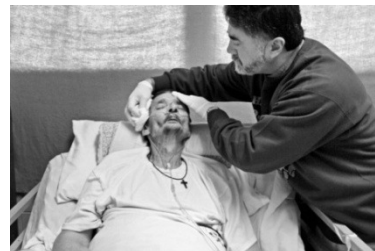
Prison Hospice: Backgrounder

End-of-life care in the prison system has been highlighted on a regular basis in Media Watch. A compilation of selected articles, reports, etc., noted in past issues of the weekly report can be downloaded/viewed on the Palliative Care Network website at: http://bit.ly/2RdegnL